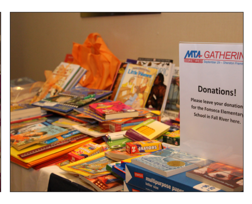
Book donations were collected for Fonesca Elementary School in Fall River.